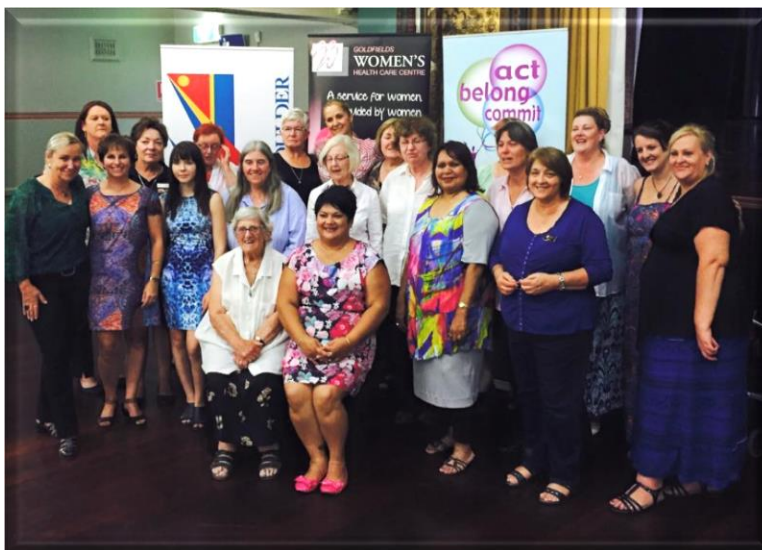
International Womens Day 2015