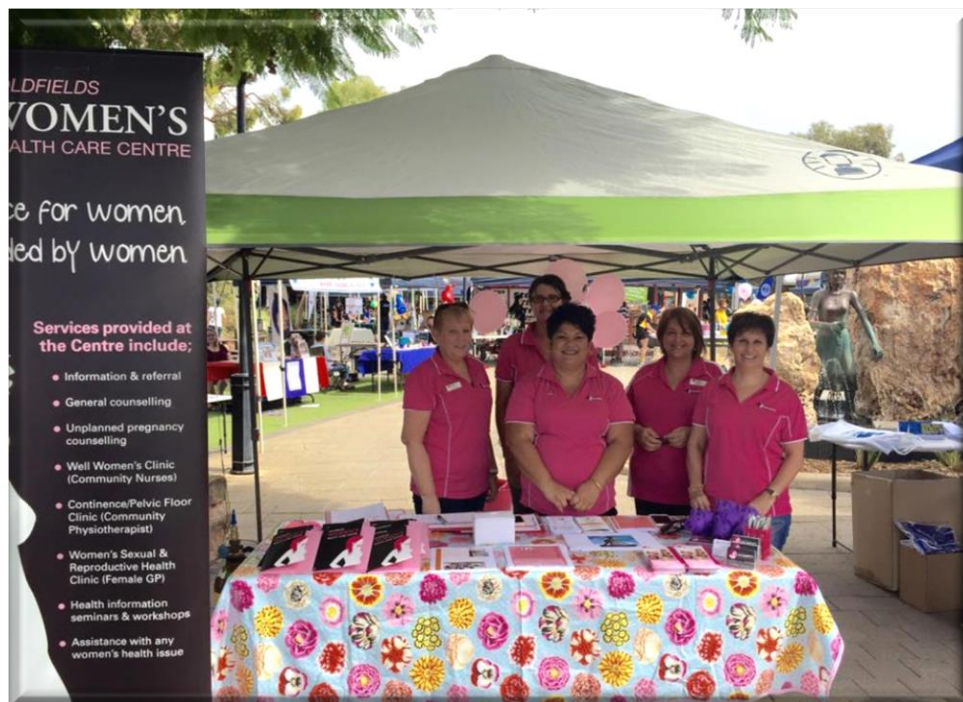
Explore the Goldfields Expo 2015