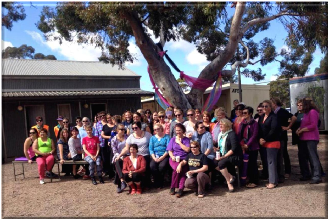
Womens Wellness Retreat – Hampton Hill Station November 2015