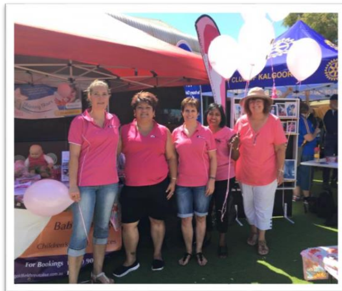
Welcome to the Goldfields Expo Feb 2016