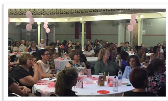
International Womens' Day-10 March 2016 #PledgeForParity Boulder Town Hall